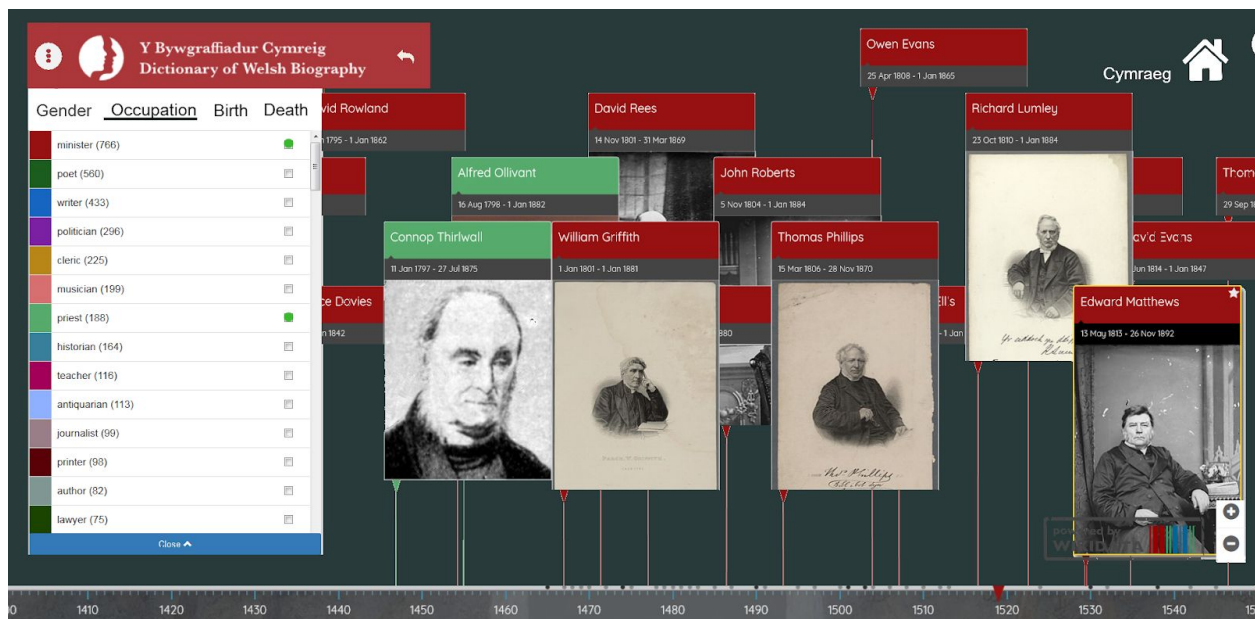
Mock-up of the interface, showing colour coded filter options